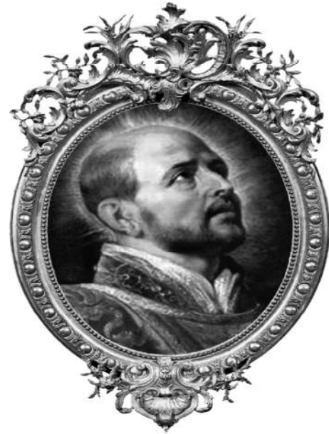
St. Ignatius of Loyola