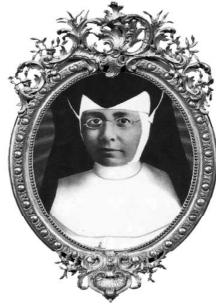
ICM Mother Foundress